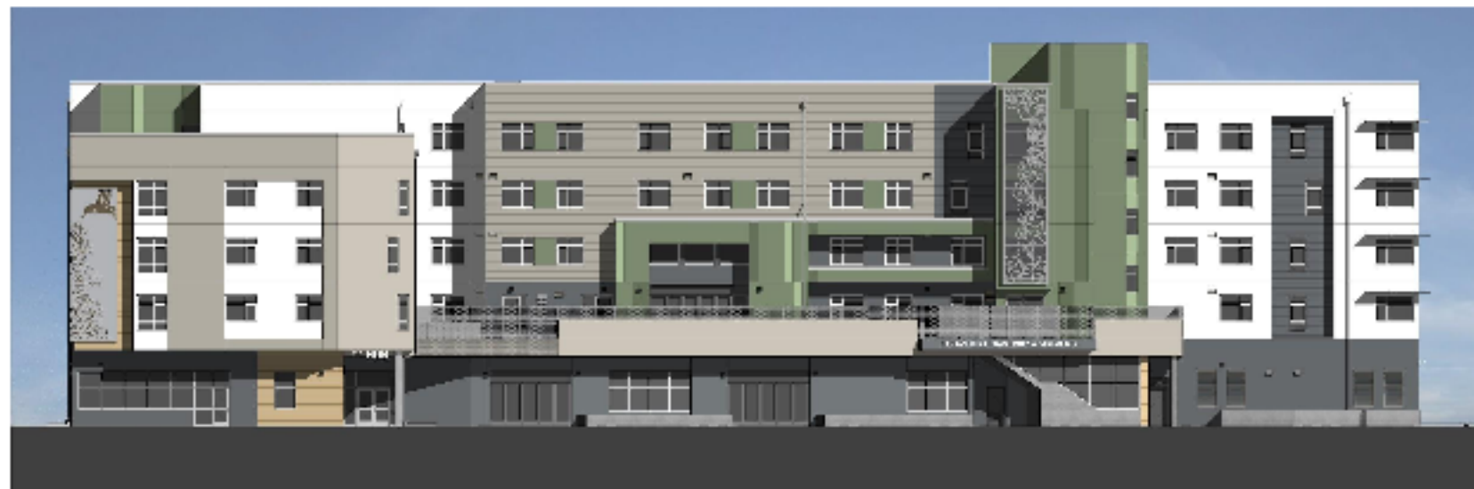
D. OTHER IDEAS?

Words would be difficult to read and may work better with murals and painting.