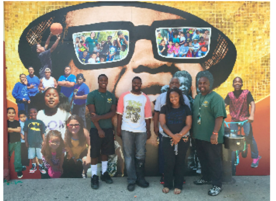
B. Digital Mural