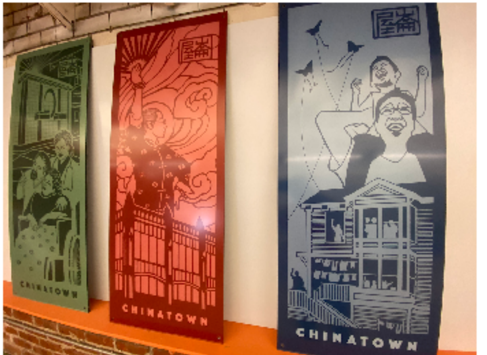
D. Glass Prints