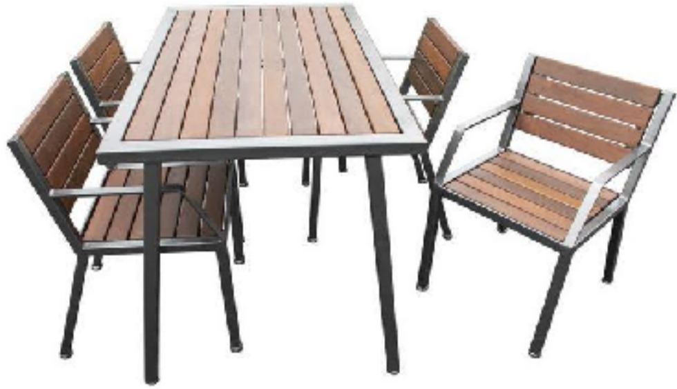
Regular Table and Chairs