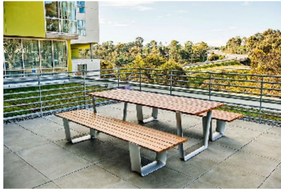
Picnic Table and Benches