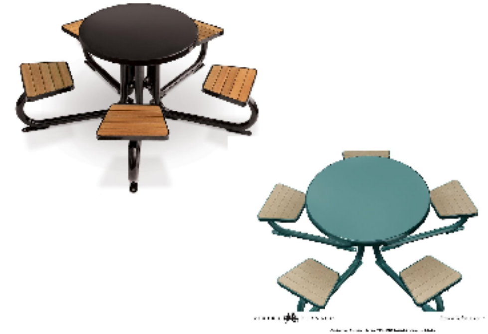
Colored Metal Table and Chairs