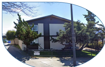
Professionally owned & managed by APM/HIP

Property Name: Hoffman 5629 Property Address: 5629 Hoffman Court | San Jose, CA 95118 Property Type: 8 Units | Shared Housing Fourplex Management Office: 481 Valley Way | Milpitas, CA 95035 408-941-1850 Referring Agency: Dial 2-1-1 https://www.211bayarea.org/santaclara/