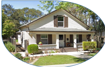
Professionally owned & managed by APM/HIP

Property Name: Market Property Address: 1597 Market St. | Santa Clara, CA 95050 Property Type: 4 Units | Shared Housing Single Family Home | Disability Eligibility Management Office: 481 Valley Way | Milpitas, CA 95035 408-941-1850 Referring Agency: 408-894-9041 Silicon Valley Independent Living Center