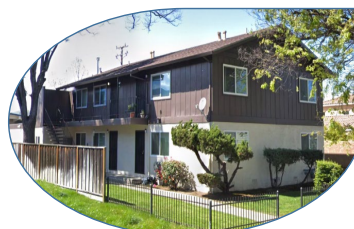
Professionally owned & managed by APM/HIP

Property Name: Hoffman 5668 Property Address: 5668 Hoffman Court | San Jose, CA 95118 Property Type: 6 Shared Housing Units | 1-2 Bedroom Fourplex Management Office: 481 Valley Way | Milpitas, CA 95035 408-941-1850 Referring Agency: Dial 2-1-1 https://www.211bayarea.org/santaclara/