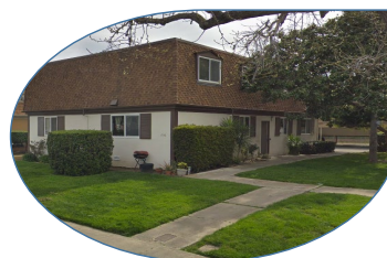
Professionally owned & managed by APM/HIP

Property Name: Ross 1713 Property Address: 1713 Ross Circle | San Jose, CA 95124 Property Type: 4 Shared Housing Units | 2-2 Bedrooms Fourplex Management Office: 481 Valley Way | Milpitas, CA 95035 408-941-1850 Referring Agency: Dial 2-1-1 https://www.211bayarea.org/santaclara/