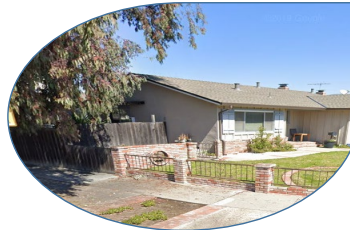
Professionally owned & managed by APM/HIP

Property Name: Ross 1731 Property Address: 1731 Ross Circle | San Jose, CA 95124 Property Type: 6 Shared Housing Units | 1-2 Bedroom Fourplex Management Office: 481 Valley Way | Milpitas, CA 95035 408-941-1850 Referring Agency: Dial 2-1-1 https://www.211bayarea.org/santaclara/