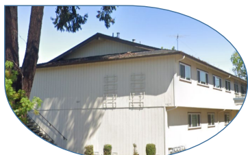
Professionally owned & managed by APM/HIP

Property Name: Barker Property Address: 3825 Barker Drive | San Jose, CA 95117 Property Type: 6 Shared Units | 1 - 3 Bedroom Unit Fourplex Management Office: 481 Valley Way | Milpitas, CA 95035 408-941-1850 Referring Agency: Dial 2-1-1 https://www.211bayarea.org/santaclara/