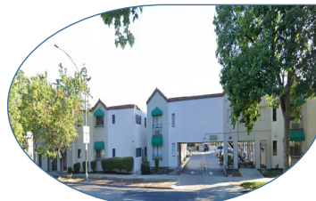
Professionally owned & managed by APM/HIP

Property Name: Calvin Property Address: 3456 Calvin Ave. | San Jose, CA 95124 Property Type: 6 Bedroom | Shared Housing Single Family Home Management Office: 481 Valley Way | Milpitas, CA 95035 408-941-1850 Referring Agency: 408-841-9660 Tupaz Homes