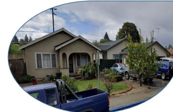
Professionally owned & managed by APM/HIP

Property Name: Minnesota Property Address: 1231 Minnesota Ave. | San Jose, CA 95125 Property Type: 4 Units | Shared Housing Single Family Home Management Office: 481 Valley Way | Milpitas, CA 95035 408-941-1850 Referring Agency: Dial 2-1-1 https://www.211bayarea.org/santaclara/