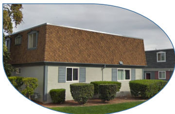
Professionally managed by HIP

Property Name: Ross 1713 Property Address: 1713 Ross Circle | San Jose, CA 95124 Property Type: 4 Shared Housing Units | 2-2 Bedrooms Fourplex Management Office: 481 Valley Way | Milpitas, CA 95035 408-941-1850 Referring Agency: Dial 2-1-1 https://www.211bayarea.org/santaclara/