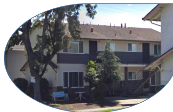
Professionally owned & managed by APM/HIP

Property Name: Donna Property Address: 1794 Donna Lane | San Jose, CA 95124 Property Type: 4 Units | 2 Bedrooms Fourplex Management Office: 481 Valley Way | Milpitas, CA 95035 408-941-1850 Referring Agency: Dial 2-1-1 https://www.211bayarea.org/santaclara/