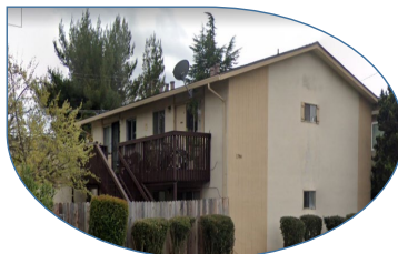
Professionally owned & managed by APM/HIP

Property Name: Curtner Property Address: 1824 Curtner Ave. | San Jose, CA 95124 Property Type: 6 Bedroom | Shared Housing Single Family Home Management Office: 481 Valley Way | Milpitas, CA 95035 408-941-1850 Referring Agency: 408-275-8770 Santa Clara County Housing Authority