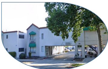
Professionally owned & managed by APM/HIP

Property Name: Casa De Novo Hotel Property Address: 2188 The Alameda | San Jose, CA 95126 Property Type: 27 Hotel Units - Interim Housing | SRO Private Bathroom / Kitchenette Management Office: 2188 The Alameda | San Jose, CA 95126 408-248-8300 Referring Agency: Dial 2-1-1 https://www.211bayarea.org/santaclara/