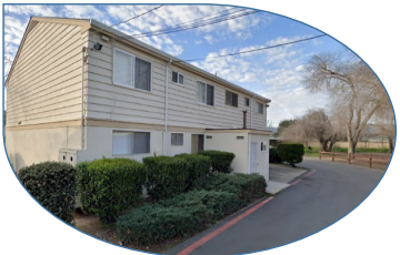
Professionally owned & managed by APM/HIP

Property Name: Ross 1726 Property Address: 1726 Ross Circle | San Jose, CA 95124 Property Type: 4 Units | 2 Bedrooms Fourplex Management Office: 481 Valley Way | Milpitas, CA 95035 408-941-1850 Referring Agency: Dial 2-1-1 https://www.211bayarea.org/santaclara/