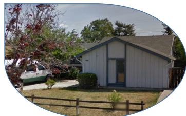
Professionally owned & managed by APM/HIP

Property Name: Burning Tree Property Address: 239 Burning Tree Dr. | San Jose, CA 95119 Property Type: 5 Bedroom | Family Housing Single Family Home Management Office: 481 Valley Way | Milpitas, CA 95035 408-941-1850 Referring Agency: Dial 2-1-1 https://www.211bayarea.org/santaclara/