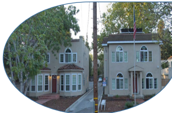
Professionally owned & managed by APM/HIP

Property Name: Thornton Property Address: 660 Thornton Way | San Jose, CA 95128 Property Type: 6 Units | Shared Housing Single Family Home Management Office: 481 Valley Way | Milpitas, CA 95035 408-941-1850 Referring Agency: Dial 2-1-1 https://www.211bayarea.org/santaclara/