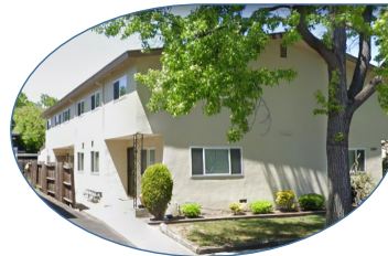
Professionally managed by APM/HIP

Property Name: Plaza Hotel Property Address: 96 S. Almaden Ave. | San Jose, CA 95113 Property Type: 47 Units | SRO Shared Bathrooms Management Office: 96 S. Almaden Ave. | San Jose, CA 95113 408-941-1850 x 143 Referring Agency: Dial 2-1-1 https://www.211bayarea.org/santaclara/