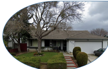
Professionally owned & managed by APM/HIP

Property Name: Branham Property Address: 1579 Branham Lane | San Jose, CA 95118 Property Type: 2 Units | 2 Bedroom Duplex Management Office: 481 Valley Way | Milpitas, CA 95035 408-941-1850 Referring Agency: Dial 2-1-1 https://www.211bayarea.org/santaclara/