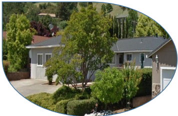
Professionally owned & managed by APM/HIP

Property Name: Longview Property Address: 365 Longview Dr. | Morgan Hill, CA 95037 Property Type: 6 Units | Shared Housing Single Family Home | Disability Eligibility Management Office: 481 Valley Way | Milpitas, CA 95035 408-941-1850 Referring Agency: Dial 2-1-1 https://www.211bayarea.org/santaclara/