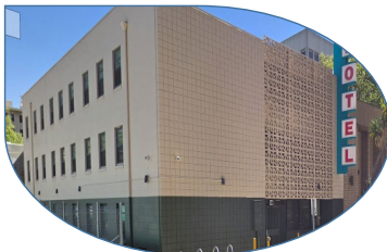
Professionally managed by APM/HIP

Property Name: Muirfield Property Address: 247/249 Muirfield Dr. | San Jose, CA 95116 Property Type: 4 Shared Housing Units | 1-4 Bedroom Single Family Home | Disability Eligibility Management Office: 481 Valley Way | Milpitas, CA 95035 408-941-1850 Referring Agency: Dial 2-1-1 https://www.211bayarea.org/santaclara/