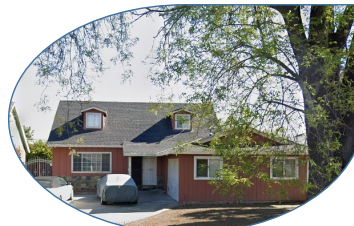
Professionally owned & managed by APM/HIP

Property Name: Barker Property Address: 3825 Barker Drive | San Jose, CA 95117 Property Type: 6 Shared Units | 1 - 3 Bedroom Unit Fourplex Management Office: 481 Valley Way | Milpitas, CA 95035 408-941-1850 Referring Agency: Dial 2-1-1 https://www.211bayarea.org/santaclara/