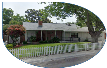
Professionally owned & managed by APM/HIP

Property Name: Sesame Property Address: 2551 Sesame Court | San Jose, CA 95148 Property Type: 6 Units | Shared Housing Single Family Home Management Office: 481 Valley Way | Milpitas, CA 95035 408-941-1850 Referring Agency: Dial 2-1-1 https://www.211bayarea.org/santaclara/