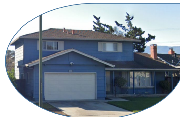
Professionally owned & managed by APM/HIP

Property Name: Casa De Novo Hotel Property Address: 2188 The Alameda | San Jose, CA 95126 Property Type: 27 Hotel Units - Interim Housing | SRO Private Bathroom / Kitchenette Management Office: 2188 The Alameda | San Jose, CA 95126 408-248-8300 Referring Agency: Dial 2-1-1 https://www.211bayarea.org/santaclara/