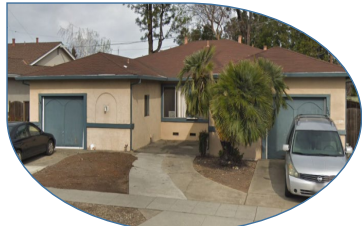
Professionally owned & managed by APM/HIP

Property Name: Bluebell Property Address: 2318 Bluebell Ave. | San Jose, CA 95122 Property Type: 6 Units | Shared Housing Single Family Home | Disability Eligibility Management Office: 481 Valley Way | Milpitas, CA 95035 408-941-1850 Referring Agency: 800-704-0900 Santa Clara Behavioral Health Services